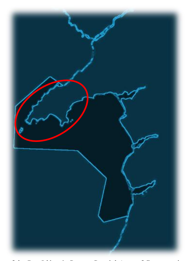
Figure 1. Map of the Pen Llŷn a'r Sarnau Special Area of Conservation (PLAS SAC – dark shaded area) with the Marine Ecosystems Project area highlighted in red

The Marine Ecosystems Project area includes inshore waters around the Llŷn peninsula. It overlaps with the Pen Llŷn a'r Sarnau Special Area of Conservation (PLAS SAC), see Figure 1 below. In practice the seaward boundary of the project area is not rigidly fixed allowing scope to consider matters of relevance to the commercial inshore fishermen and the PLAS SAC.