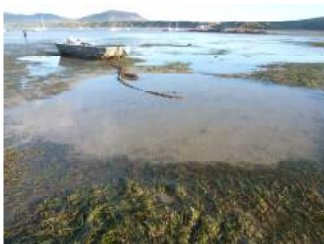
Plate 3. Intertidal seagrass mooring scar at Porthdinllaen.

There is extensive evidence from the international peer reviewed academic literature of the damage caused by boat moorings on seagrass [19, 23-26] and this has been corroborated at a local scale at Porthdinllaen [1-5]. It can be concluded, with a very high degree of certainty, that boat moorings damage seagrass. In addition to the plants themselves, moorings may also damage the their associated fauna and may affect the important role that seagrass plays in providing ecosystem services to the coastal zone [27, 28].