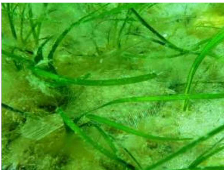
Plate 1. Seagrass at Porthdinllaen is extensive throughout the intertidal and subtidal areas and contains an abundant and diverse fish fauna. The seagrass is of particular importance as a fish nursery habitat for species such as plaice.

The present report reviews the available literature to provide a design for a field study to investigate recovery of mooring scar areas within the subtidal area of the seagrass at Porthdinllaen. This work is required to inform understanding about the severity and longevity of the impacts by moorings on the seagrass at Porthdinllaen.