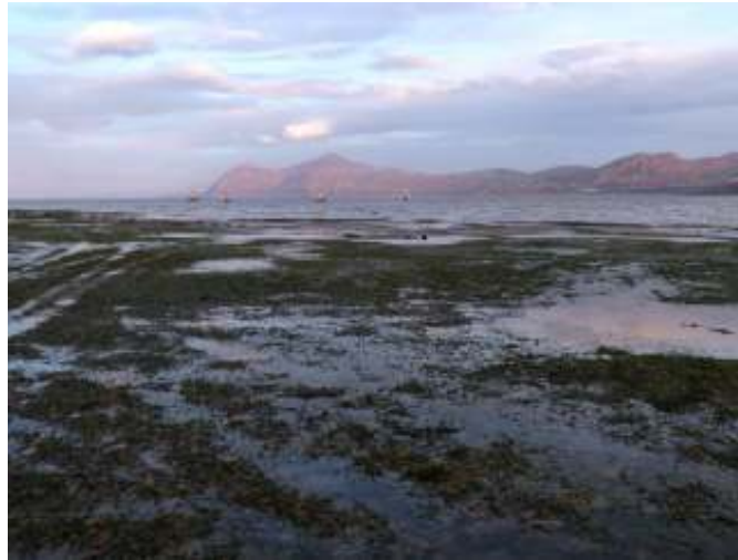
Plate 2. Seagrass at Porthdinllaen is being damaged by a range of disturbances, particularly boat moorings.

Of additional concern to the Porthdinllaen seagrass are the impacts associated with the intertidal use of tractors and four wheel drive vehicles [6]. The above mentioned anthropogenic impacts are all taking place at the same time as the world is experiencing increasing levels of environmental change associated with climate change and ocean acidification [21]. This may be potentially reducing the resilience of the Porthdinllaen seagrass meadow to severe weather related impacts [22].