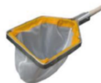
Aquatic Dipping Net